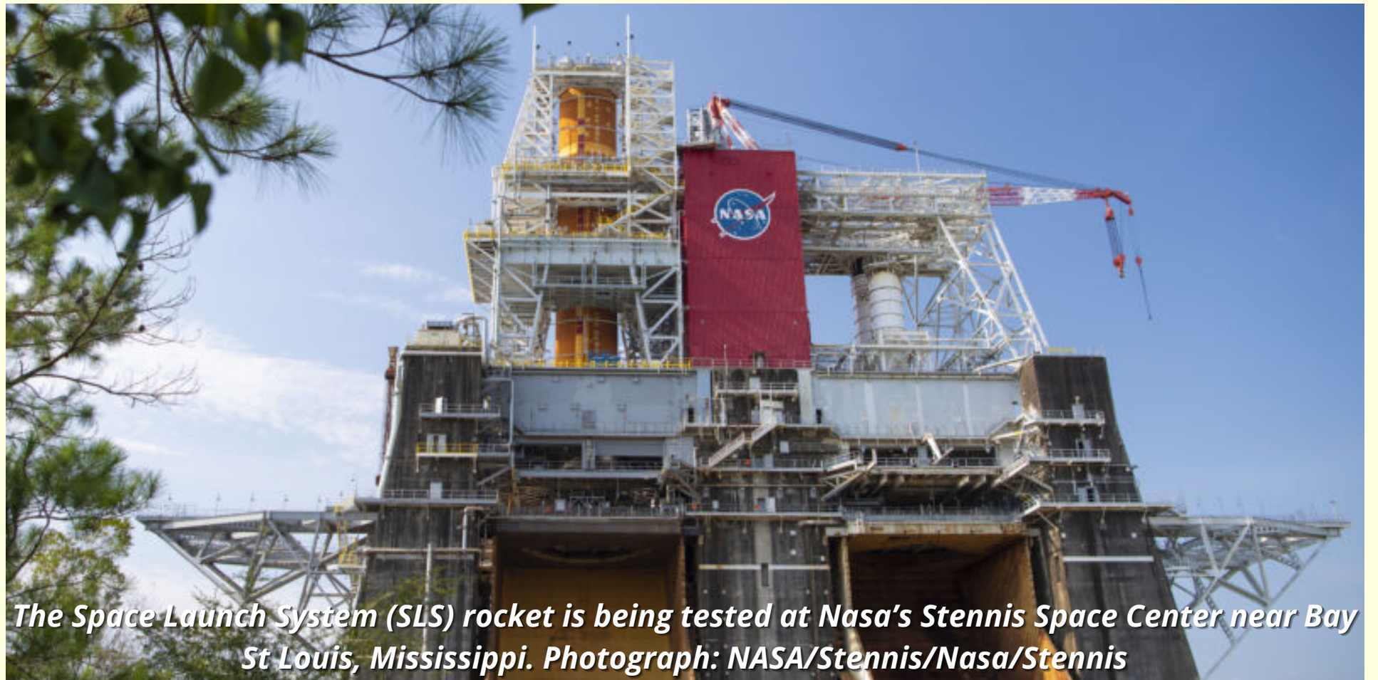
The Space Launch System (SLS) rocket is being tested at Nasa's Stennis Space Center near Bay St Louis, Mississippi.

Progress for NASA's Artemis program has been somewhat slow with a few setbacks along the way. Congress has granted NASA over 20 billion dollars since 2011 in the pursuit of designing new space shuttles to get astronauts to the moon by 2024. The eventual moon mission will be the third Artemis mission with the first mission being set for November of 2021 after a few years of setbacks, as the original launch date was set back in 2017 between December of 2019 and June 2020. This setback has cost NASA an additional 33% in the mission cost, or an increase of roughly 2 billion dollars. Before this unmanned mission occurs the engine for this new shuttle, which consists of 4 shuttle engines, needs to be tested and refined. That coupled with the complication of COVID may push this launch date back again, but in any case manned missions to the moon and beyond are closer to reality with each passing year.