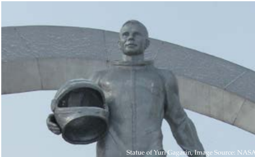
Statue of Yuri Gagarin

This Friday marks the 58th anniversary of Yuri Alekseyevich Gagarin's historical launch into space. Aboard the Soviet Union's Volstock 1 , Gagarin not only traveled into space, he also completed a full Earth orbit in just 89 minutes. At the time, this put the Soviet Union ahead in the space race by leaps and bounds.